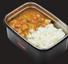
Curry & Rice