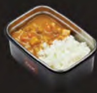
Curry & Rice